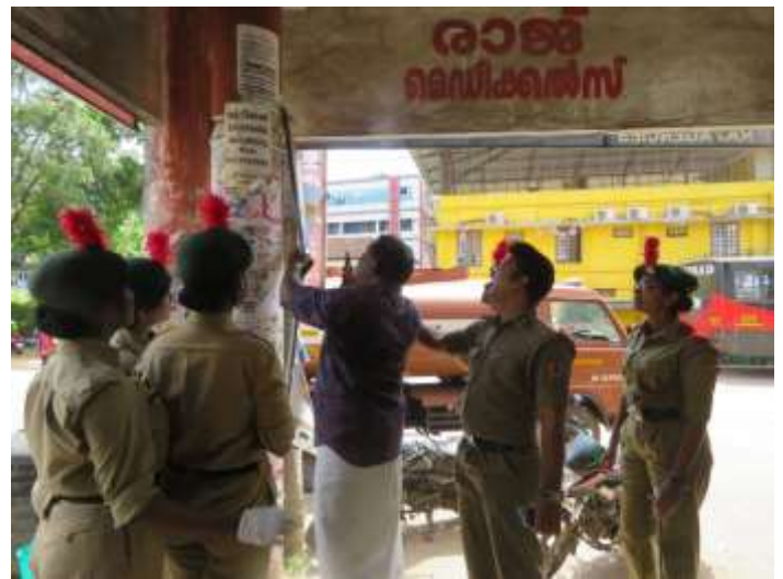
Photographs on Cleanliness drive